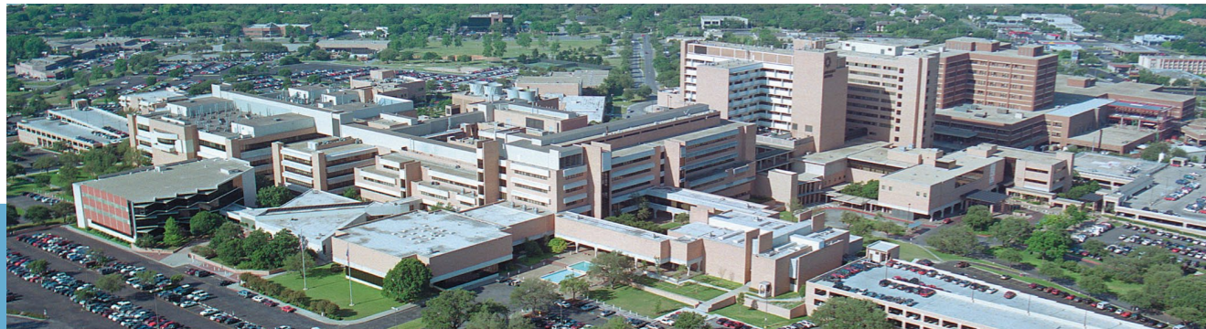
Joe R. & Teresa Lozano Long (Central) Campus

We fully endorse the recommendations by the THECB to the 82nd Texas Legislature to continue funding at the 2009 level of $44.7 million. HB 4471 improves the Professional Nursing Shortage Reduction Program, which was established in 2001, to help stem the shortage of nurses in Texas, by rewarding high-performing nursing programs with up-front money to hire additional faculty. HB 4471 also holds nursing programs accountable by creating a new incentive for schools to admit and graduate more nurses. The bill requires a nursing program to apply to the THECB to use grant funds from the Professional Nursing Shortage Reduction Program to enroll or graduate a specific number of students. If the nursing program fails to meet its enrollment or graduation benchmark, THECB may require them to return unearned grant money or withhold future grant awards.