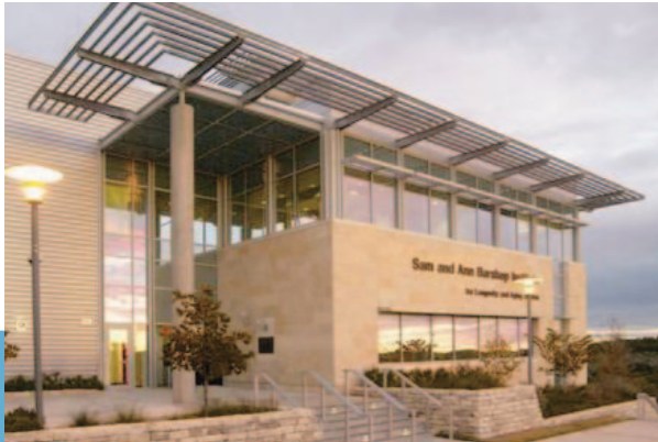
The Barshop Institute