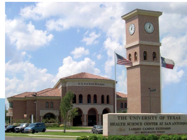
Regional Campus in Laredo